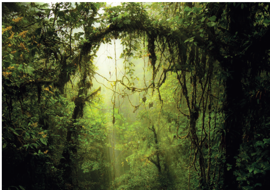
Conservation efforts risk getting snared in a tangle of aims.

AUTOBIOGRAPHY Carl Djerassi, father of the Pill, reflects on his life and literature p.36